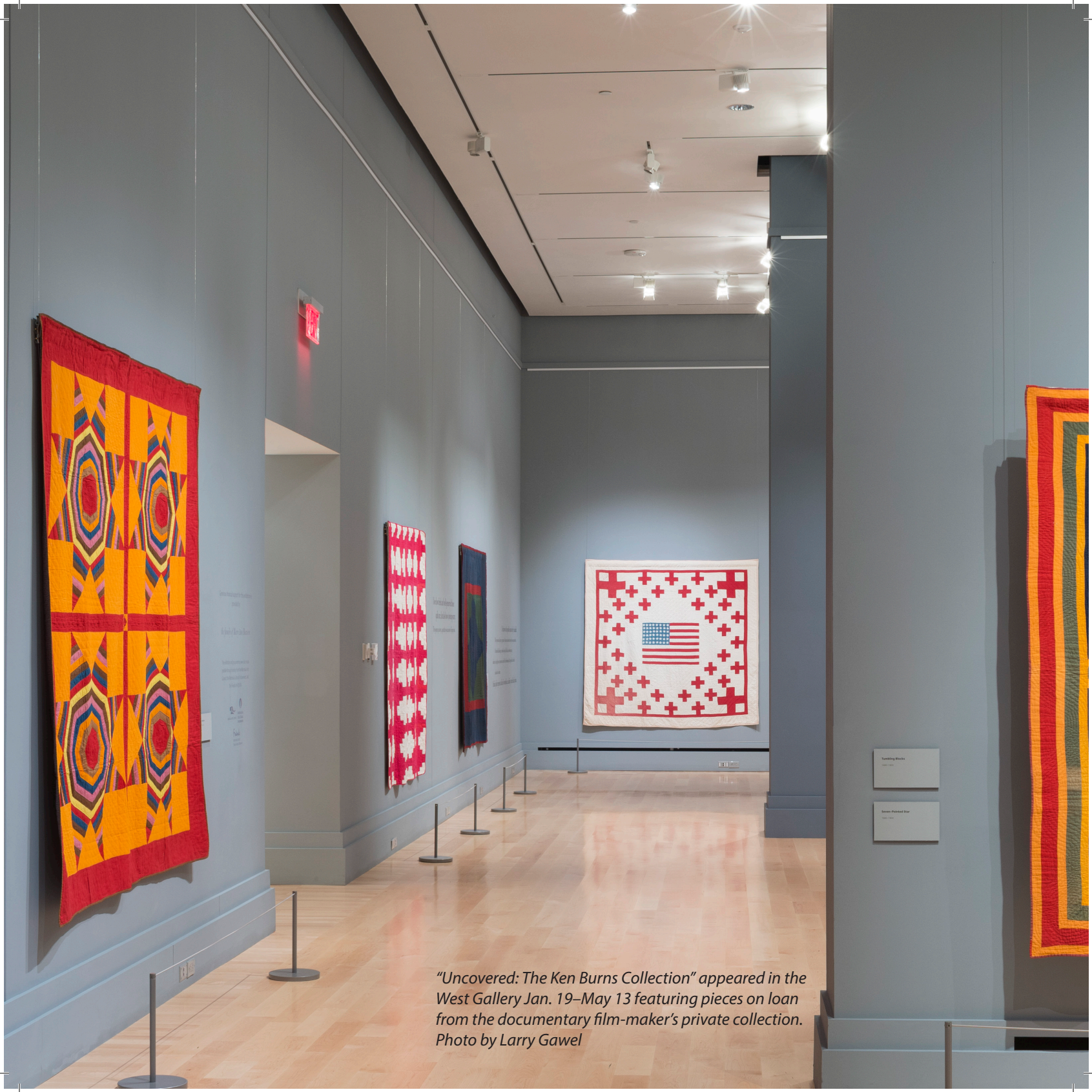
"Uncovered: The Ken Burns Collection" appeared in the West Gallery Jan. 19–May 13 featuring pieces on loan from the documentary film-maker's private collection.