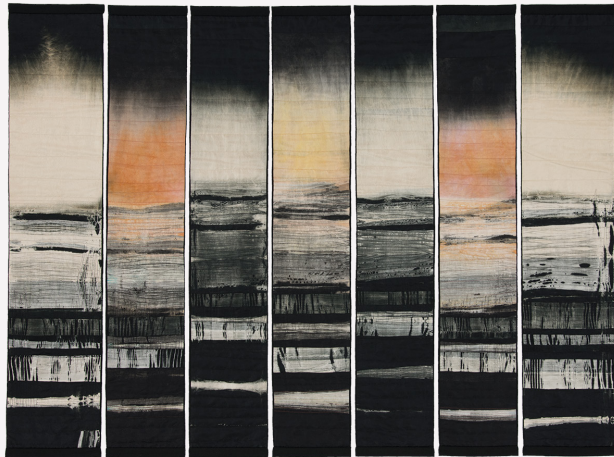
Calligraphy Judith Content United States, 1998