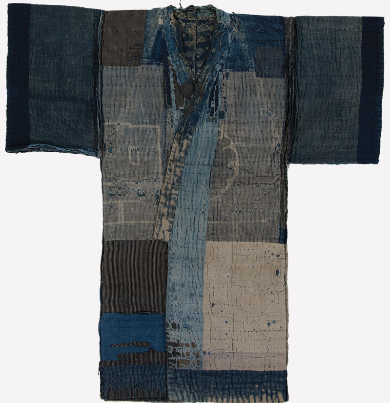
Boro Kimono Maker Unidentified Japan, 1880-1900