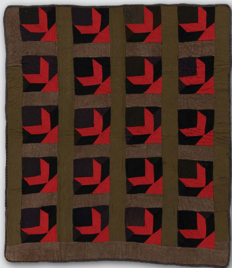
V for Victory / World War I Chevron Maker unidentified c. 1917-1918