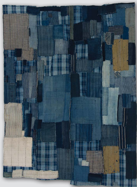
Japanese Boro Futon Cover