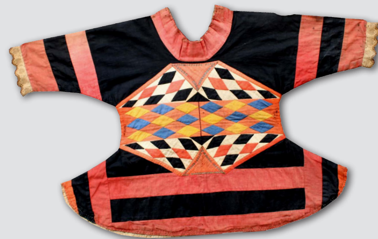
Indonesian (Sulawesi) women's blouse with patchwork