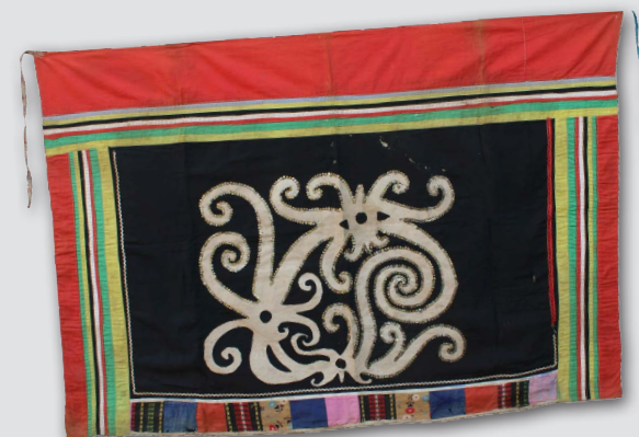
Indonesian (Borneo) waist wrap