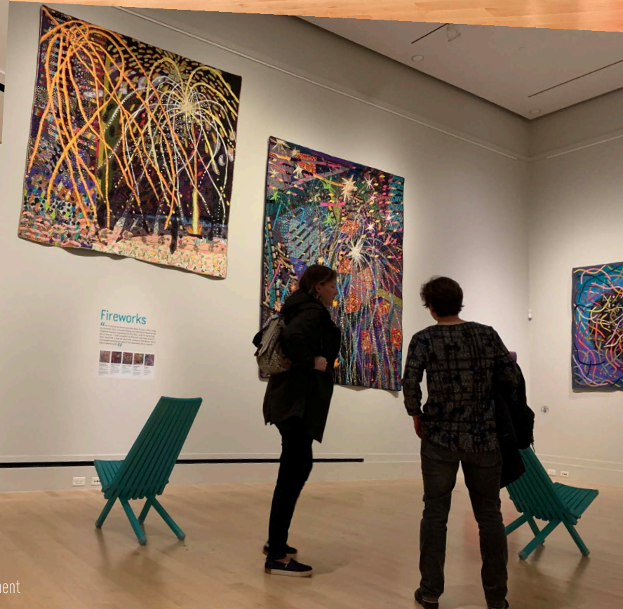
Modern Meets Modern