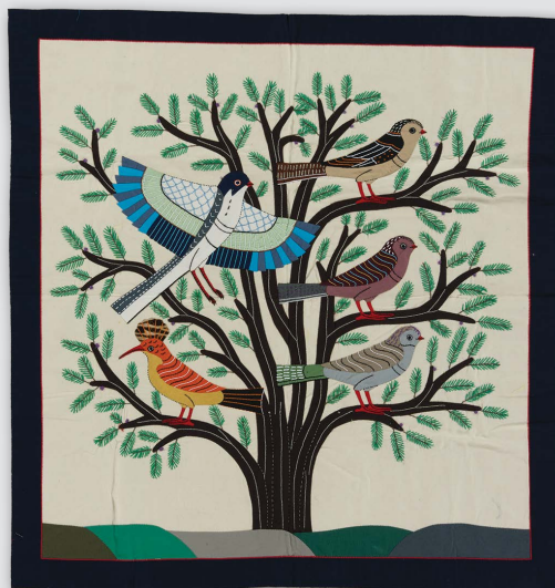
Panel (Birds) Possibly made by Sayeid Farougah Egypt, 2021