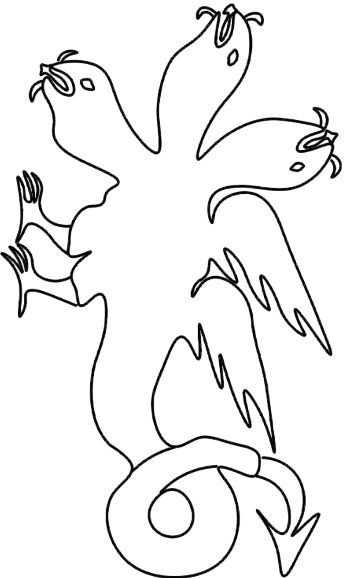
Detail of Asafo Flag, Unidentified maker from the Fante ethnic group, Ghana, 1920-1940 Gift of the Robert and Ardis James Foundation, IQM 2020.067.0001